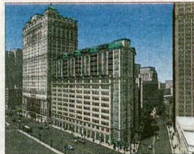
Rendering from the Roxbury Group

Contact JOHN GALLAGHER at 313-222-5173 or gallagher@freepress.com.